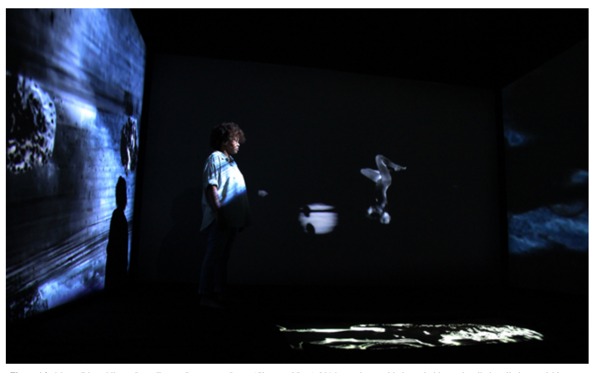
Figure 16: Mame-Diarra Niang, Since Time is Distance in Space (Chapter: 1 Rise), 2016—ongoing, multi-channel video and audio installation, variable dimensions—installation view in '(Un)Charted Grounds', The Matter Art Project, Dakar, 2022, photo by Mame-Diarra Niang, courtesy of the artist and Stevenson Gallery, Cape Town, Johannesburg and Amsterdam

soundtrack, such imagery produced the contemplative atmosphere of an outer and inner journey, both physical and psychic. A seemingly female, Black body, yet not thoroughly definable as such, appeared ambiguously both grounded and afloat, either whole or fragmented but never in place, observing but not constrained by framing limits. The work is indebted to Niang's own migratory life from an early age, and to a personal and political journey of selfdiscovery, of return and reconnection to her Senegalese roots after her father's death.<sup>38</sup> Like the artist's own trajectory of dislocation, the work changes in each stop, always and never being the same, archiving and adapting to its many times and spaces. For migrating and diasporic subjects, the experience of time is indeed marked by distance in space: the distance from a past space of more-or-less rooted belonging, left behind either by the desire for a future space of fulfilment or survival, or by force. Psychically, diasporic subjectivity is inescapably ambivalent: between memory and desire, loss and hope, neither here nor there; the past inhabits, hopefully nourishing instead of limiting, present visions for better futures. Niang's dreamy landscape portrayed a journey of emancipatory rising, of being and becoming, of up- and re-rootedness, of un- and re-belonging: a subject's embodied and spiritual journey from ancestral soil to the cosmos and back.<sup>39</sup>