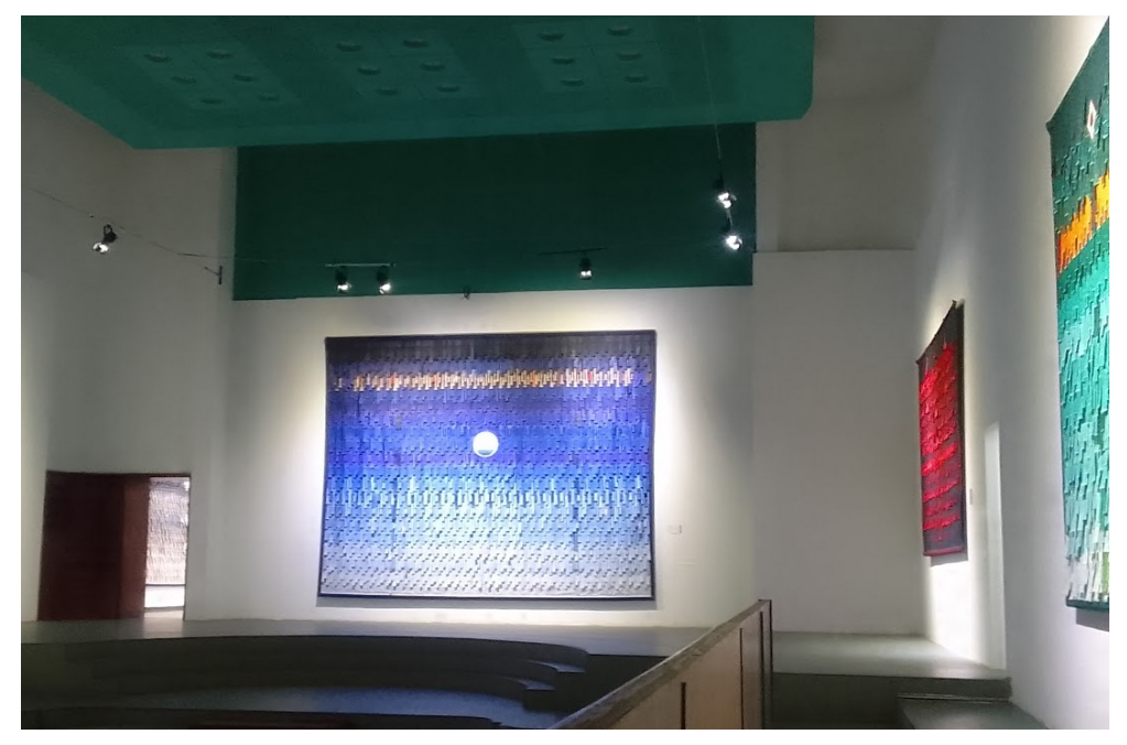
Figure 17: Abdoulaye Konaté, 'Le maître/The Master', 2022, exhibition view, 14th Dakar Biennale, Ancien Palais de Justice, Dakar, 2022