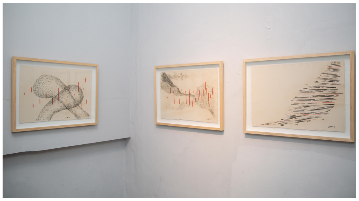
Figure 3: Mzwandile Buthelezi, The Texture of Silence , 2020–2021, charcoal and pastel on Fabriano paper, variable dimensions, with sound by The Texture of Silence – installation view in 'Ĩ NDAFFA#/Forger/Out of the Fire', 14th Dakar Biennale, Ancien Palais de Justice, Dakar, 2022