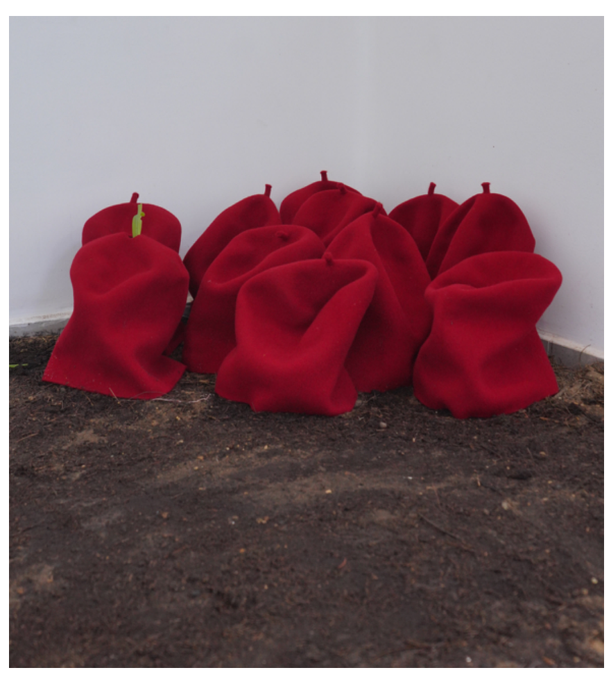
Figure 10: Binta Diaw, 1.12.44, 2022, sound, soil, seeds (millet, maize), chechias, variable dimensions – installation view in 'Binta Diaw: Toolu Xeer (Le champs de pierres)', Cécile Fakhoury Gallery, Dakar, 2022, photo by Khalifa Hussein, courtesy of the artist and Cécile Fakhoury Gallery, Dakar, Abidjan and Paris