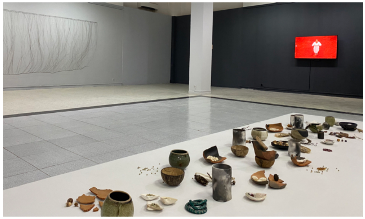
Figure 12: Exhibition view, 'Unsettled', 14th Dakar Biennale, Musée Théodore Monod d'Art Africain, Dakar, 2022, with Zayaan Khan, Comensality through Deep Time, 2022, clay, sand, salts and ash, variable dimensions (front); and Bronwyn Katz, Wees Gegroet, 2016, video, colour, sound, 11.25 min (back right) and kx'orakx'ora (Renew), 2022, copper-coated wire, rust and twine, variable dimensions (back left), image courtesy of Greer Valley

'Unsettled' presented land as living memory of (un)belonging, and human and non-human ancestry as community. Rituals, objects, images, texts and sounds were gathered in performative, material and digital archives, which, future-oriented, reclaimed several forms of restitution for actual repair.