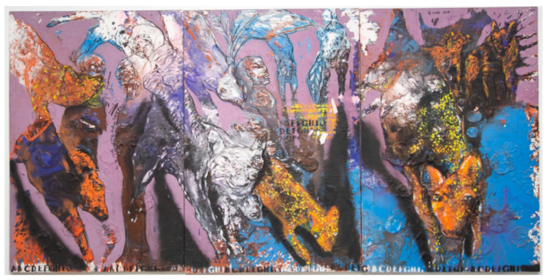
Figure 18: Soly Cissé, Chien jaune, 2020, papier mâché and acrylic on canvas, 150 x 100 cm (x3) – shown in 'Soly Cissé: La légende/The Legend', 14th Dakar Biennale, Galerie Nationale d'Art, Dakar, 2022

deserving, prominently installed homages to African female masters? We look forward to seeing their work, or the broader context for their absence discussed, in 2024.