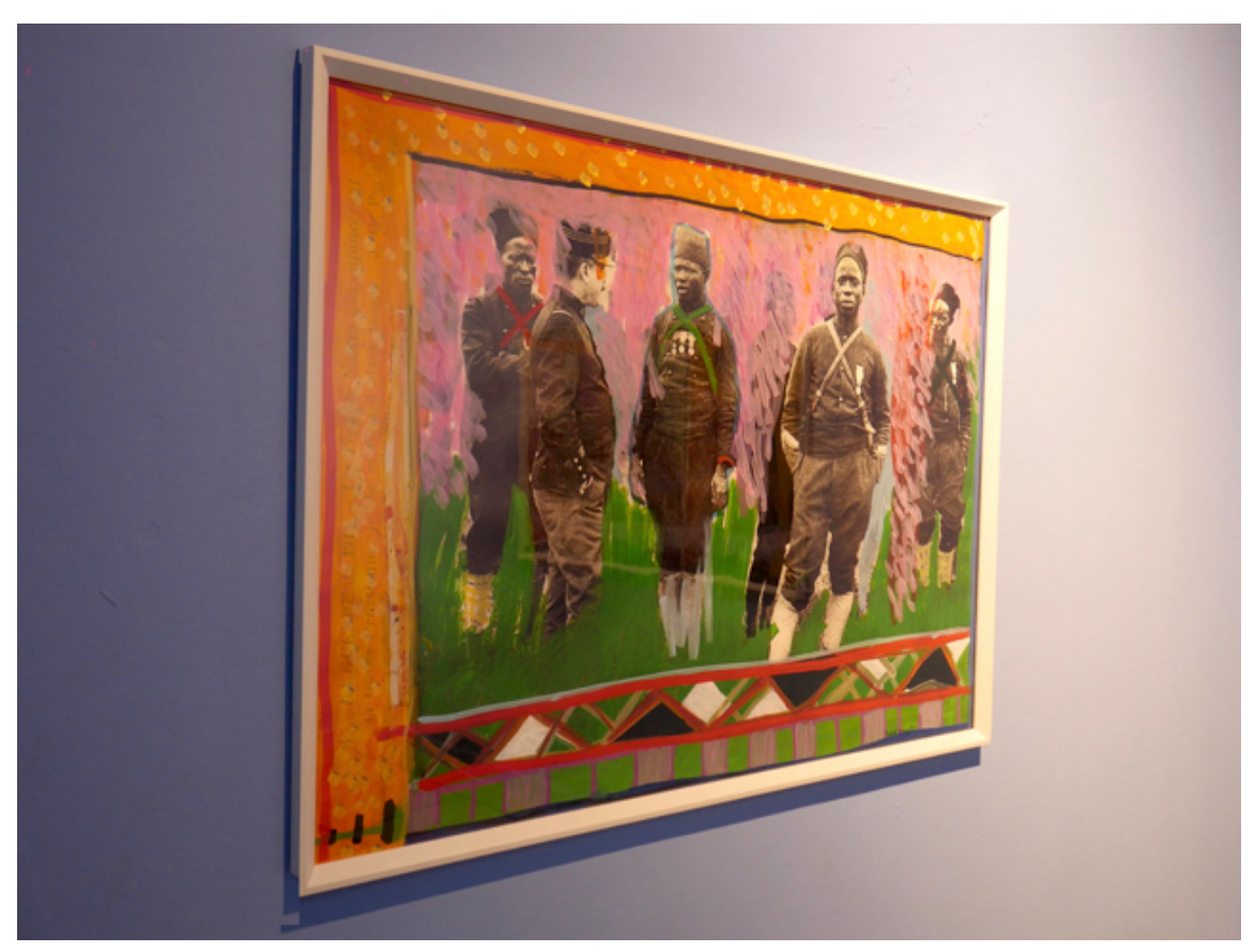
Figure 8: Modou Dieng, Déjeuner sur l'herbe with the Celebrated Black Troops, 2020, mixed media on cotton paper photograph, 92 x 120 cm – installation view in 'Î NDAFFA # / Forger / Out of the Fire', 14th Dakar Biennale, Ancien Palais de Justice, Dakar, 2022, courtesy of the artist