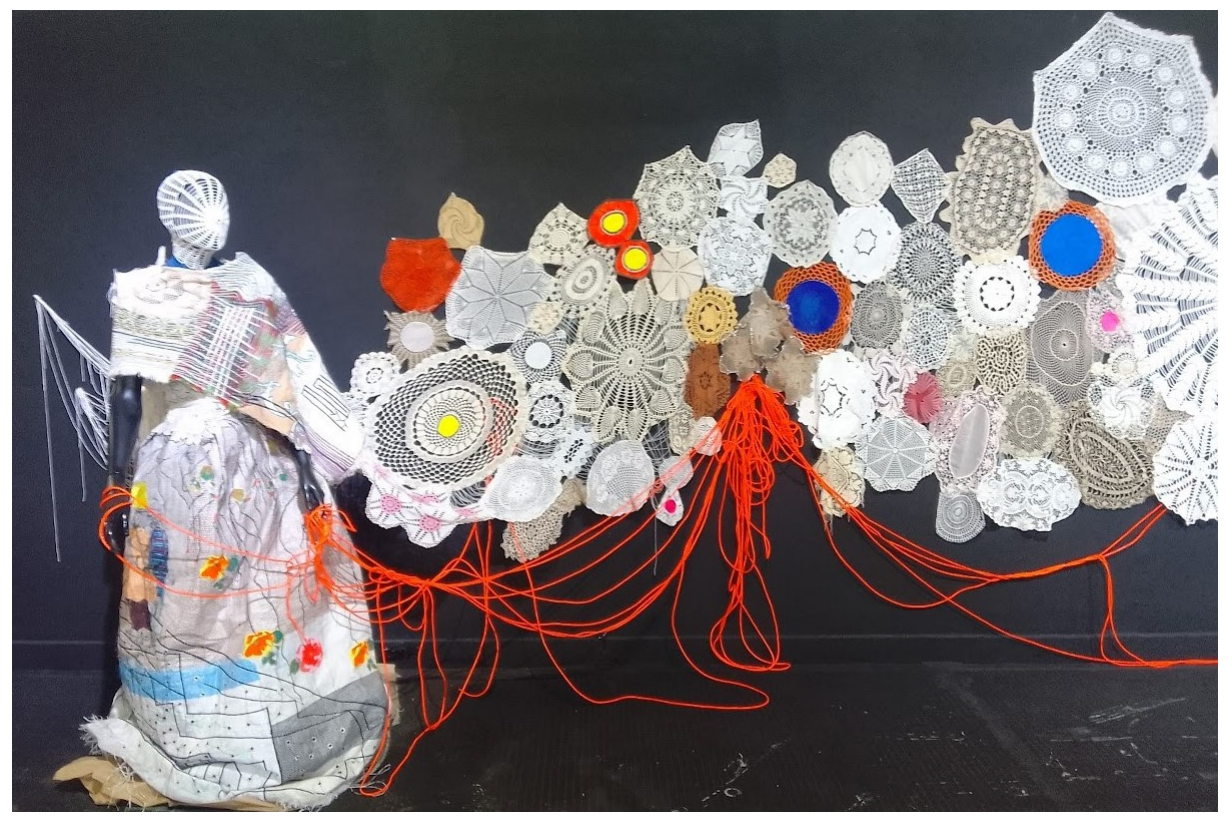
Figure 7: Ana Silva, Legado (Tributo), 2020, mixed media, variable dimensions – installation view in 'Ĩ NDAFFA # / Forger / Out of the Fire', 14th Dakar Biennale, Ancien Palais de Justice, Dakar, 2022

braids, headscarves and garments of mothers, sisters and daughters. Without romanticising their real-life struggles, Silva nonetheless captures their majestic dignity. Resisting patriarchal entanglement, Silva's women appear resolutely interlaced by a gendered, intergenerational politics of solidarity and care, leaving a potent legacy in their wake, to which she unfolds her tribute as a trail and tail/tale of testament.