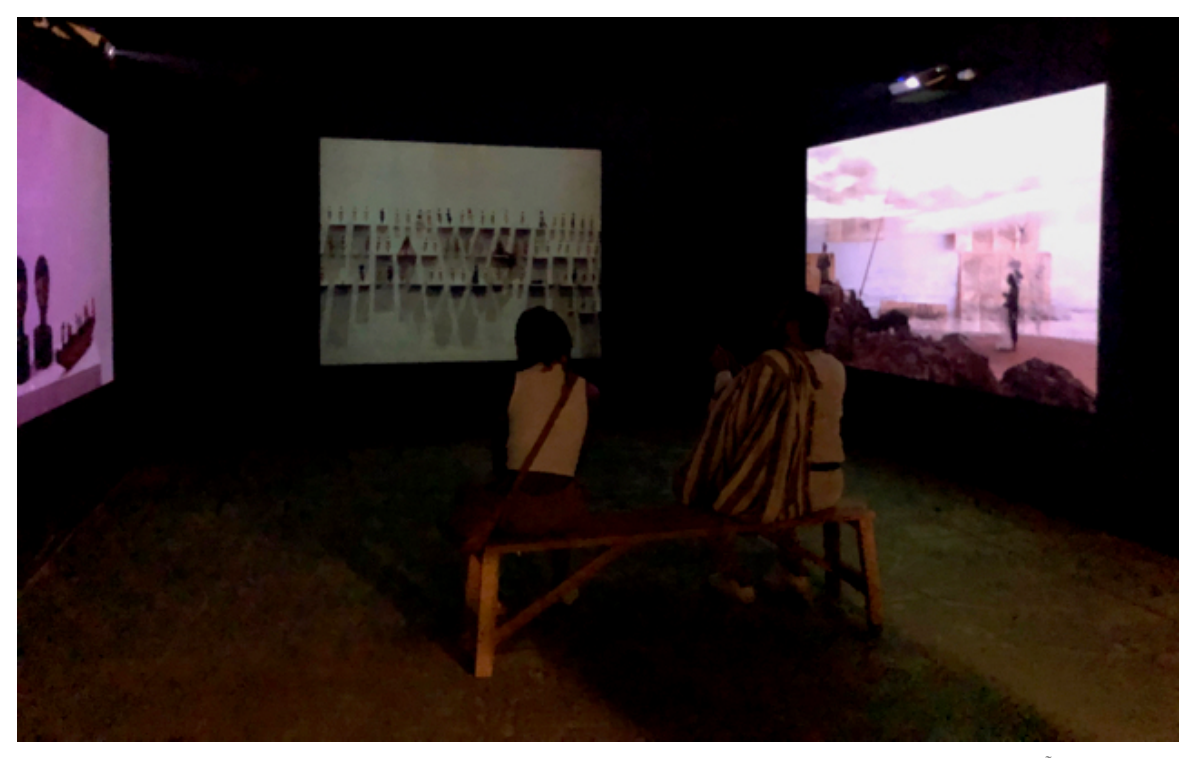
Figure 5: Fluxus do Atlântico Sul, Crossing Archives, 2020, video and archival installation, variable dimensions — installation view in 'Ĩ NDAFFA#/Forger/Out of the Fire', 14th Dakar Biennale, Ancien Palais de Justice, Dakar, 2022

African and Afro-Brazilian culture and to establish exchanges with African countries after their independence. <sup>21</sup> Importantly, they also document the various ways in which the artists themselves have activated and critically engaged with the collections through artistic practice. From a decolonial perspective, they thus unveil the historical complexities of Bahia's (and Brazil's) relationship with African heritage and contemporaneity, which is deeply fractured by the colonial and postcolonial legacies of slavery and the failures of the post-abolition period. They also highlight institutional and artistic attempts to acknowledge the extent to which Brazilian cultures and identities are Afro-diasporic, despite the genocidal and commodifying violence of colonialism, slavery and structural racism.