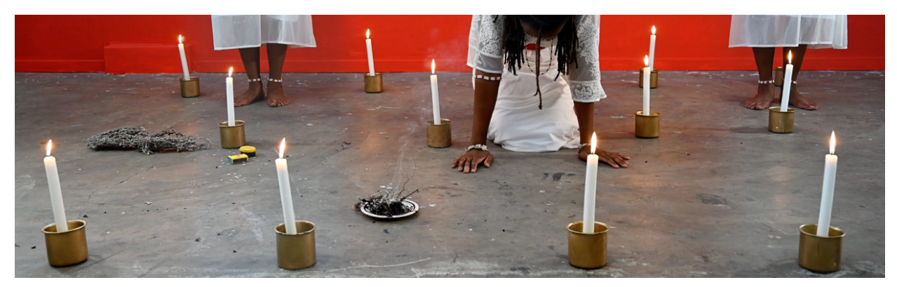
Figure 6: Sethembile Msezane, video still from Ukukhanya , 2019, video, colour, sound, 5.56 min – shown in 'Ĩ NDAFFA#/Forger/Out of the Fire', 14th Dakar Biennale, Ancien Palais de Justice, Dakar, 2022

subjectivity, at times split into several priestess-looking presences, into a lineage of ancestral knowledges and practices that remain contemporary. An almost meditative sense of repetition and change is produced by doubling and tripling the body, multiplying the ritual objects and gestures into series and sequences, and on-loop screening. Lighting and burning become material and performative metaphors for celebrating, remembering, mourning, purging, cleansing, reflecting, contemplating, envisioning and gestating, somewhere between past, present and future. Standing, kneeling and lying down connect the female body to enmeshed height and depth, sun and soil, life and death, but the ground-oriented action and viewpoint keep reminding one of rooted ancestry as a nourishing way forward, and of the necessity of quiet in order to move.