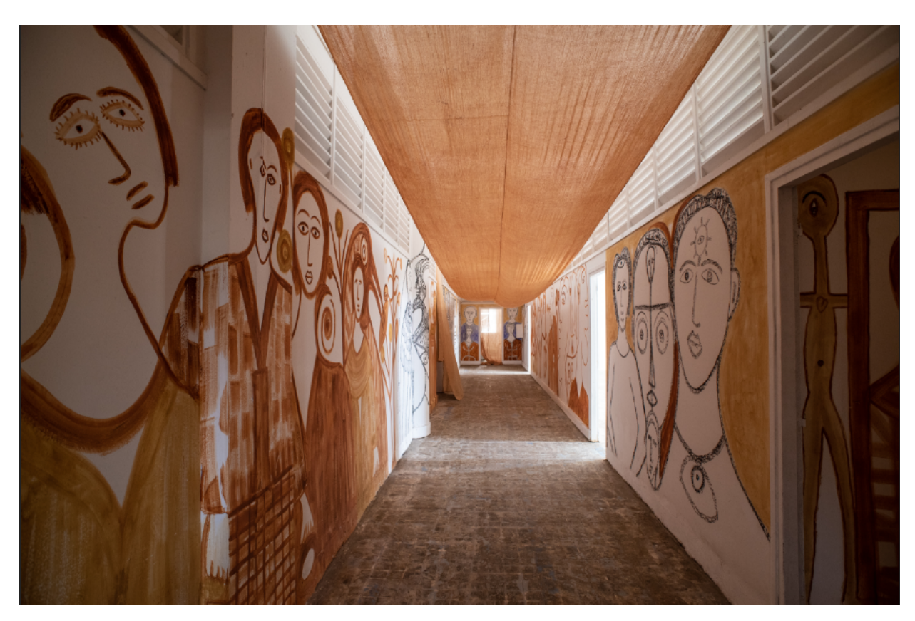
Installation View: Alioune Diouf, "Ubeku (Ouverture)" 2020

"Ubeku (Ouverture)" is on view at Selebe Yoon until January 27, 2021.