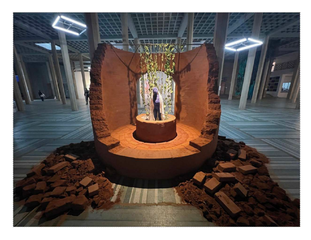
Beya Gille Gacha, L'Autre Royaume (2022). Beads, wax, resin, raw earth, tissue, plants, activated carbon. Exhibition view: Ĩ NDAFFA # – Forger – Out of the fire, Dakar Biennale 2022 (19 May–21 June 2022).

What is in contestation here is not merely a peripheral transformation of aesthetics and modes of representation, but a call that aligns with an epistemological shift currently underway in Black and non-Western parts of the world. This is an invitation to embrace different forms of making and knowing that are embodied, experiential, and capable of healing and reparation.