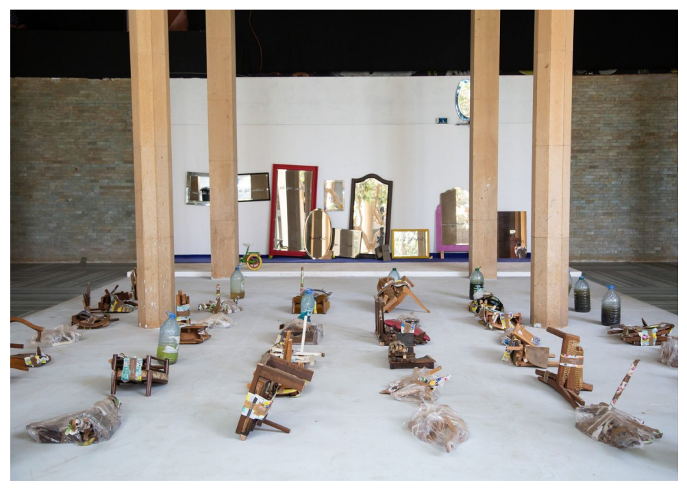
Front to back: Jeanne Kamptchouang, Abattis (2019–2022). Installation. 34 chairs, 8 studs; Jefais semblant (2019–2022). Installation. Frosted mirrors, bicycle, alarm clock, vest, glass. Dimensions variable. Exhibition view: \tilde{I} NDAFFA # – Forger – Out of t hefire, Dakar Biennale 2022 (19 May–21 June 2022).

Entering the former Palais de Justice, one is greeted by a monumental presence exuding from a building that once was a symbol of state power. As if to respond to this monumentality, works exhibited near the entrance attempt to mirror the building in size. These include Alioune Diagne's painting of a street scene in Lexique des signes inconscients (2020) and Beya Gille Gacha's raw earth installation L'Autre Royaume (2022) featuring a blue figure standing within a well-like structure.