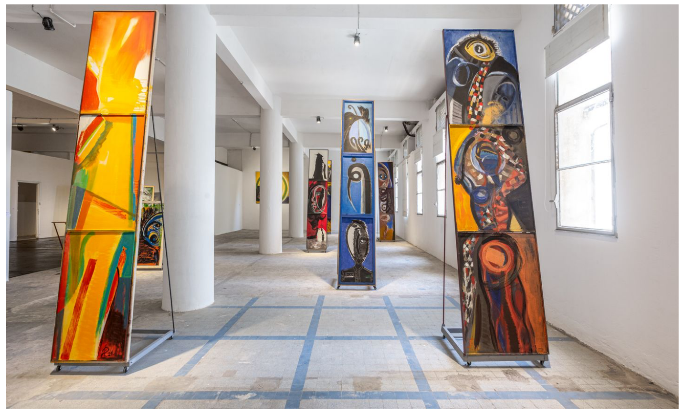
Exhibition view: El Hadji Sy, Now / Naaw, Selebe Yoon, Dakar (19 May-30 July 2022).

El Hadji Sy's work is a culmination of the tugging spirit of defiance that has long constituted the rumbling underbelly of post-independence Africa. Paintings like La Capture de la vache (2016) and L'envol (2022) are indicative of Sy's penchant for the performative, and his tendency to subvert the formalities of form and aesthetics.