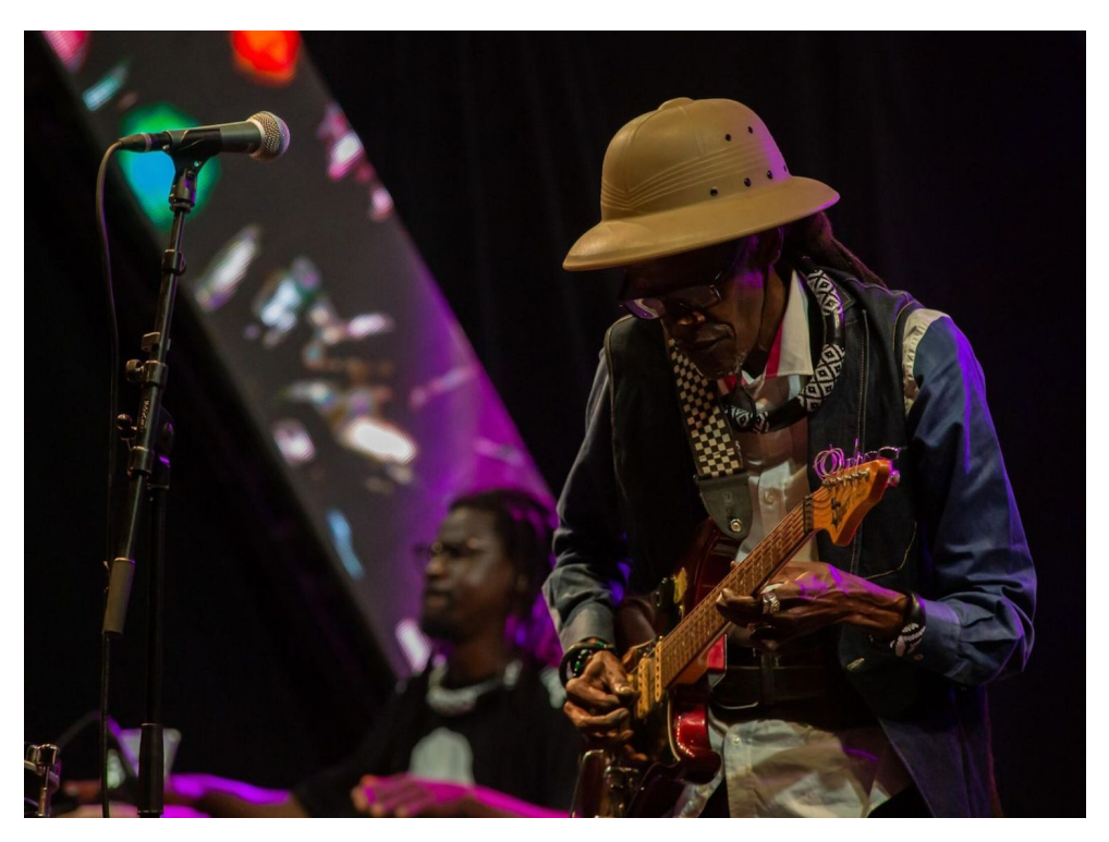
Cheikh Lô performing as part of the musical programme of \tilde{I} NDAFFA # – Forger – Out of the fire, Dakar Biennale 2022 (19 May–21 June 2022).

The Dakar Biennale is arguably the most famous art event on the African continent. Conceived in 1989, it is also Africa's longest-running biennial.