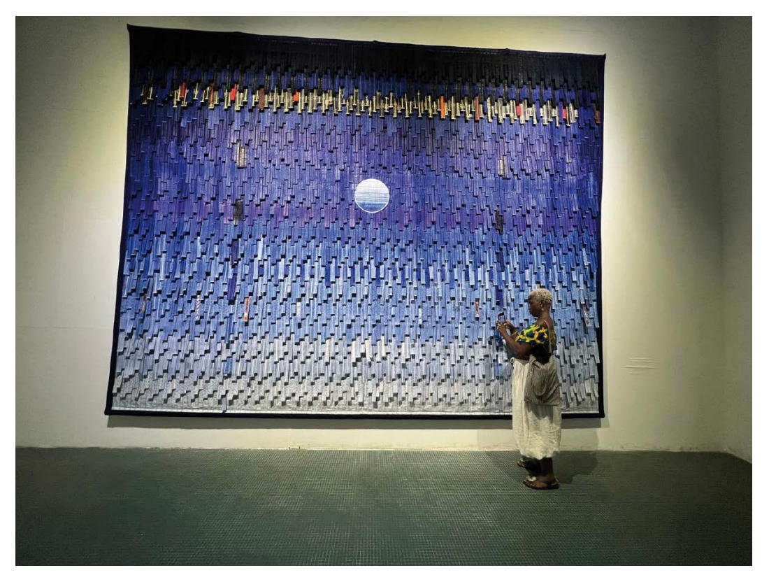
Abdoulaye Konaté, Lune bleue 2PM (2019). Bazin noble. Exhibition view: Ĭ NDAFFA # – Forger – Out of the fire, Dakar Biennale 2022 (19 May–21 June 2022).

Konaté's works consist of large-scale, colourful weavings of dyed cloth pieces from Mali. They thrive on a detailed replication of intricate patterns that morph into picturesque scenes, such as Lune bleue 2PM (2019), featuring a moon hovering against a background in gradating shades of navy to sky blue.