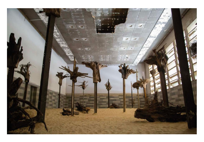
Emmanuel Tussore, De Cruce (2022). Installation. Wood, metal, and sand. Dimensions variable. Exhibition view: Ī NDAFFA # -Forger - Out of the fire, Dakar Biennale 2022 (19 May-21 June 2022).

The operative nature of any organic (living) process is premised on the interchangeable relationship between big and small. Sometimes they take on the form of a paradox; other times, they are contradictions. We find these tendencies in the making of potent thoughts as we strive to reimagine history and rewrite narratives.