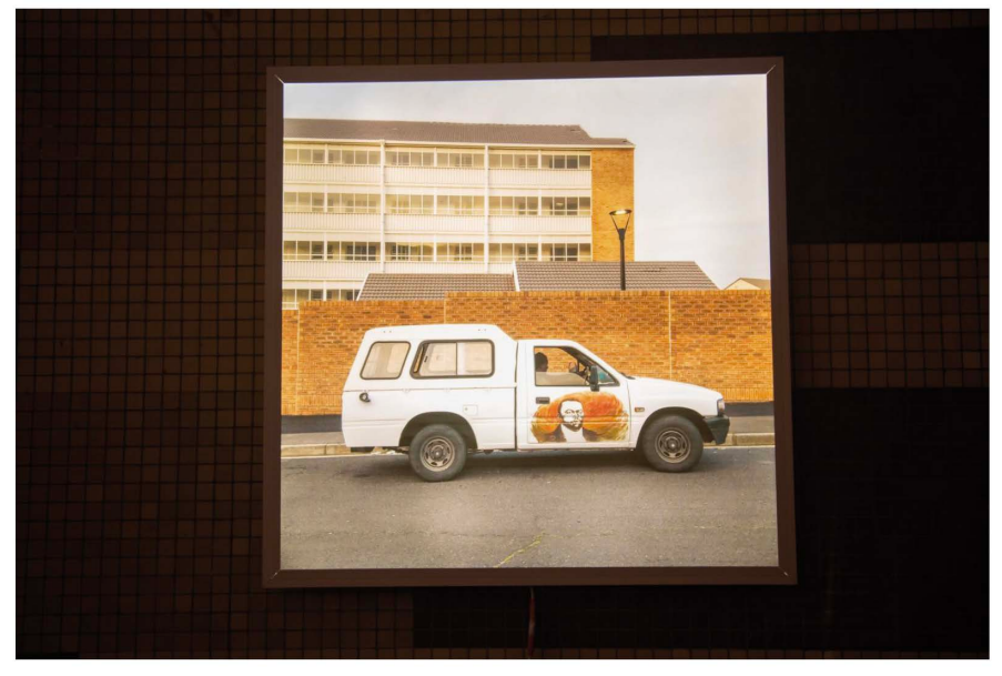
Exhibition\ view: \ \tilde{\it I}\ NDAFFA\ \#-Forger-Out\ of\ the\ fire,\ Dakar\ Biennale\ 2022\ (19\ May-21\ June\ 2022).\

murder of George Floyd adding weight to the exigency of the theme, Ĩ NDAFFA # – Forger – Out of the fire. Coined from a Serer verb, which indicates an invitation 'to forge', the word Ĩ Ndaffa is a literal reference to the transformation of the resistant quality of matter, often metal.