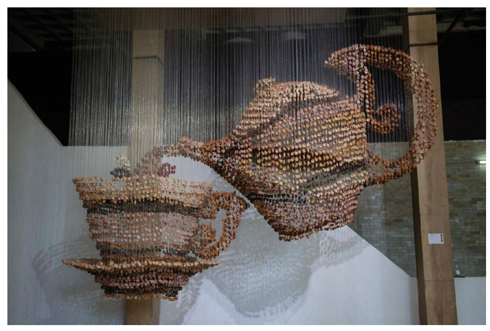
Ngozi-Omeje Ezema, Think Tea, Think Cup III (2020). Clay, plastic, metal. Exhibition view: Ĩ NDAFFA # – Forger – Out of the fire, Dakar Biennale 2022 (19 May–21 June 2022).

To any critical audience, the intricacies of the works are swallowed by the forced effort to place them on a pedestal, thus ascribing them the status of placeholder. The failure is in the absence of any attempt to acknowledge the contradictions of scale.