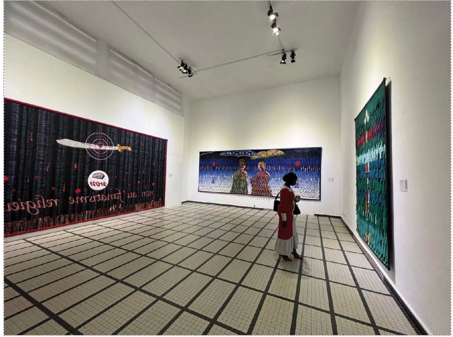
Exhibition view: Abdoulaye Konaté, Dakar Biennale 2022 (19 May-21 June 2022).

I personally felt more drawn to works among these presentations—those transcending the realm of appearance towards possibilities of revelation, while retaining their areas of opacity within their poetics of relation.