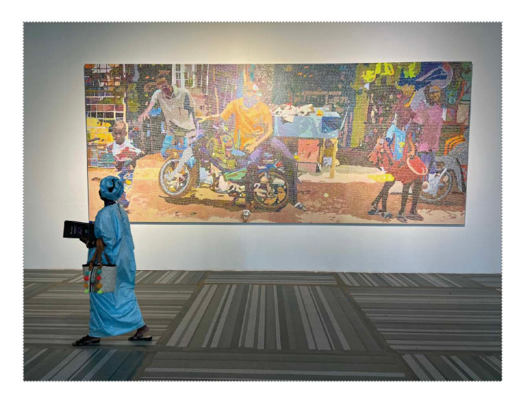
Alioune Diagne, Lexique des signes inconscients (2020). Acrylic on canvas. 350 x 680 cm. Exhibition view: Ĩ NDAFFA # – Forger –Out of the fire, Dakar Biennale 2022 (19 May–21 June 2022).

Entering the former Palais de Justice, one is greeted by a monumental presence exuding from a building that once was a symbol of state power. As if to respond to this monumentality, works exhibited near the entrance attempt to mirror the building in size. These include Alioune Diagne's painting of a street scene in Lexique des signes inconscients (2020) and Beya Gille Gacha's raw earth installation L'Autre Royaume (2022) featuring a blue figure standing within a well-like structure.