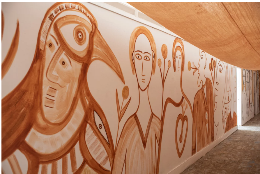
Alioune Diouf, Le Boulevard , 2020. Installation view at Selebe Yoon, Dakar.